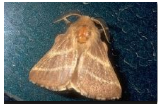
Adult moth of Eastern tent caterpillar— Image: Ric Bessin, UK Entomology