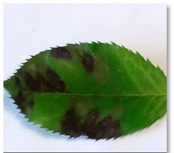
Irregularly-shaped lesions of Downy mildew on rose.—Image: N. Ward-Gauthier, UK plant Pathology

More information: <u>Publication PPFS-OR-W-10</u>