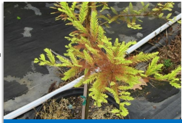
Figure 1. Nursery bald cypresses severly affected by rust mite and mineral deficiency.