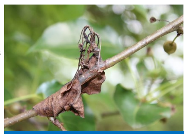
Figure 2. Infection for flower spurs travels down into twigs. Cankers can girdle branches, restricting water uptake to tops of branches.

Disease management includes both cultural practices and preventative bactericides. Because the fire blight bacterium overwinters in cankered branches, removal of diseased plant tissue before bud break (mid to late winter) is critical.