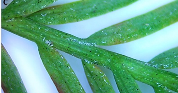
Figure 2. Bald cypress rust mites. A) White to yellowish cigar shaped mites. B) Mite covered with white wax. C) White molted skins shed by mites during development