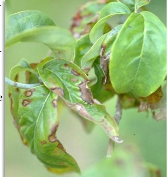
Figure 1. Dogwoods affected by anthracnose develop leaves with medium-to-large spots with purple borders or scorched tan blotches.

Leaves may develop medium-to-large spots with purple boarders or scorched tan blotches that enlarge to kill the entire leaf (Figure 1). Infected petioles and branches exhibit dieback, typically beginning on lower branches (Figure 2). Cankers with a dark brown discoloration