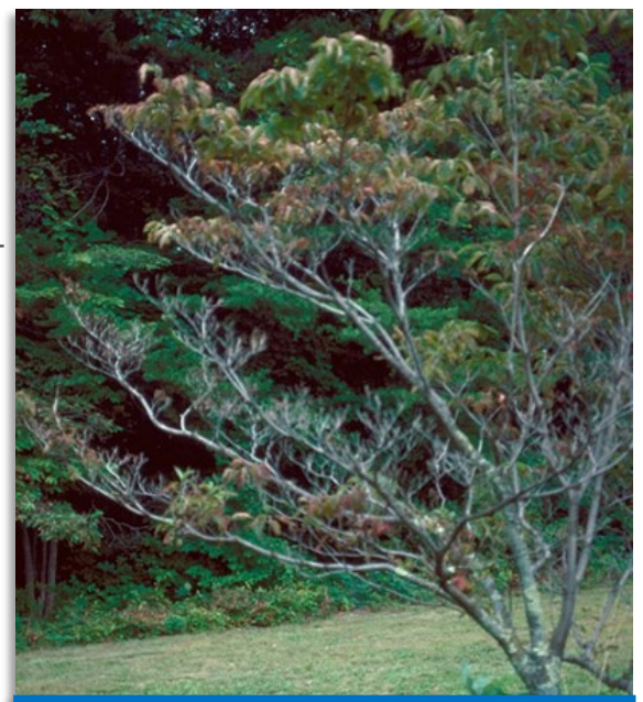
Figure 2. Infected petioles and branches exhibit dieback, typically beginning on lower branches.