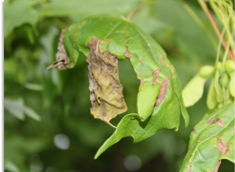
Figure 1. Symptoms of anthracnose on shade trees include dark blotches and leaf distortion.