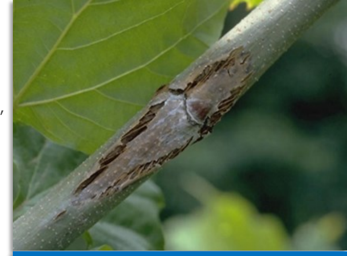
Figure 2. The fungal pathogens that cause anthracnose may also infect twigs and branches. Resulting cankers girdle affected branches.

Ash anthracnose: Common symptoms include brown blotches along leaf edges. Leaf drop often results, and then new leaves soon emerge. Causal fungus: Discula umbrinella .