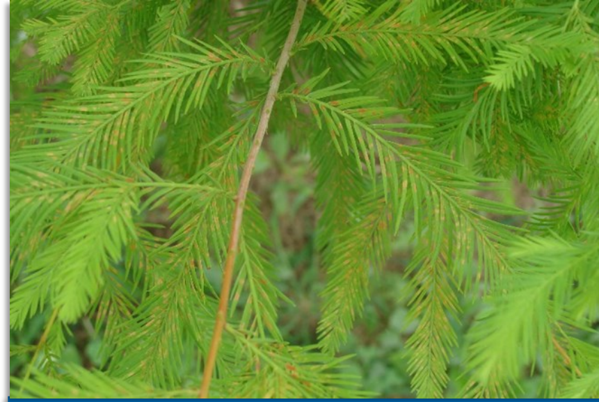
Figure 3. Landscape bald cypress affected by rust mites.

Rust mites feed by rasping the epidermal cells to suck their content. The needles initially turn yellow and later brown and red as the damage progresses. In nursery, trees with obvious mineral deficiency showed severe damage (Figure 1).