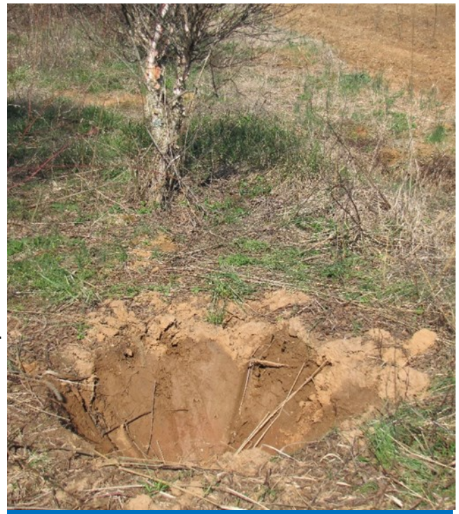
Individual hole after selective tree harvest

which are incorporated into the soil before the next cropping cycle. Green manure, cover crops sown in the soil while they are still green with no seeds, are commonly use in field nurseries. Green manure crops can be planted in summer or fall and plowed later in the fall or spring, respectively. Mowing is recommended to avoid seeding. The increase of soil organic matter is not