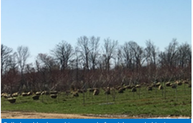
Balled and burlapped trees ready for pickup and shipping.