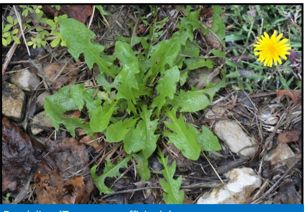
Dandelion (Taraxacum officinale)

Dandelion (Taraxacum officinale) : It is a perennial that is disseminated by wind-blown seeds and new shoots develop from broken taproot segments. Fully developed plants are difficult to remove by hand due to the deep taproot. Seedlings emerge from late spring to early autumn.