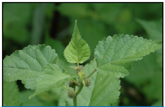
Mulberry weed (Fatoua villosa)

Mulberry weed (Fatoua villosa) : It is an aggressive invasive species, and a summer annual (perennial further south). Plants seed at very early stage, when the plants have three leaves. Fruit are dehiscent and release seeds far from the mother plant.