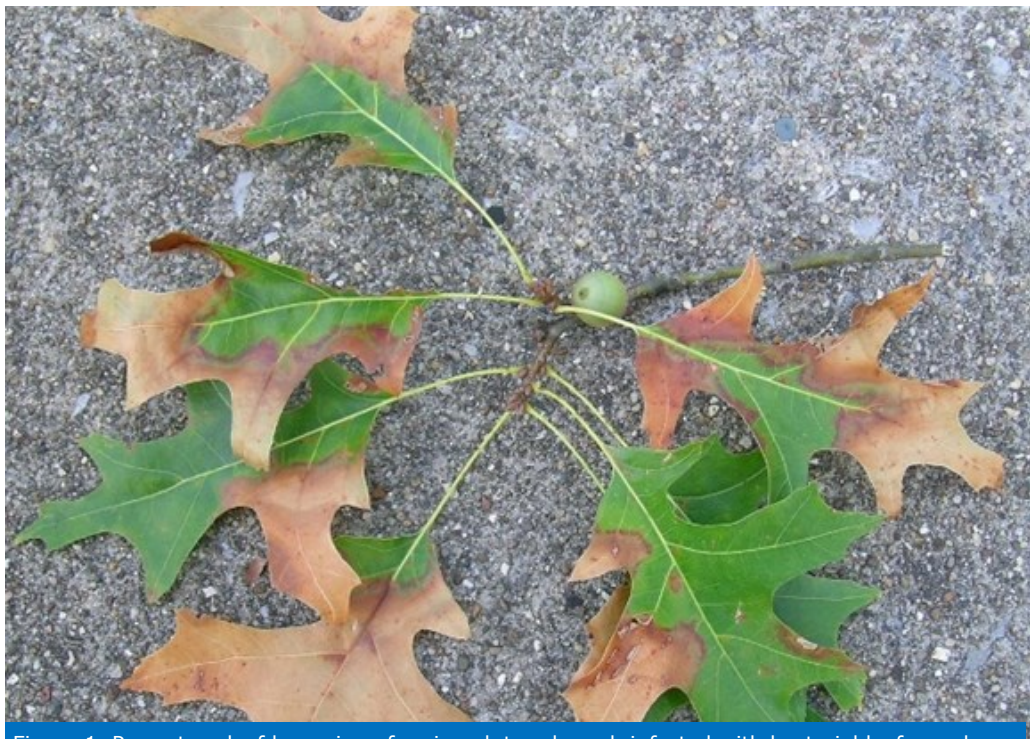
Figure 1. Premature leaf browning of a pin oak tree branch infected with bacterial leaf scorch.