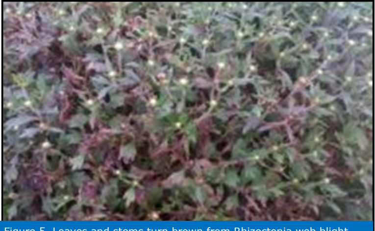
Figure 5. Leaves and stems turn brown from Rhizoctonia web blight.