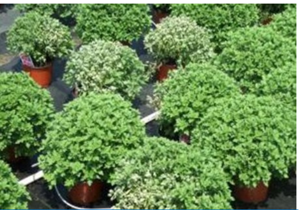
Figure 6. Fusarium wilt results causes yellowing and wilting as fungi affect vascular tissue.

This fungal pathogen invades vascular systems and causes leaf yellowing and plant wilt (Figure 6). Fusarium fungi infect plant roots and then colonize internal tissue. Collapse of these "water and nutrient highways" can result in starvation of upper plant parts. Often, a single branch or plantlet will show symptoms before the rest of the plant. Necrosis or brown streaks may be visible on outer surfaces of stems, and cross sections usually indicate necrotic (brown decay-