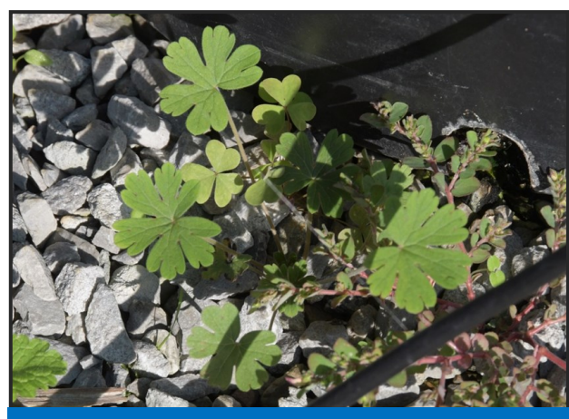
Carolina geranium (Geranium carolinianum)

carolinianum ): It is a biennial, sometimes a winter or summer annual. It forms a rosette the first year and grows upright and blooms the following year. Seeds germinate in late summer, early autumn or spring.