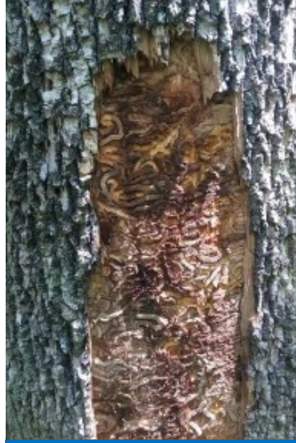
Figure 2. Characteristic Emerald ash borer galleries and sloughing bark on infested ash.

Additionally, very high mortality of ash trees has occurred among unprotected