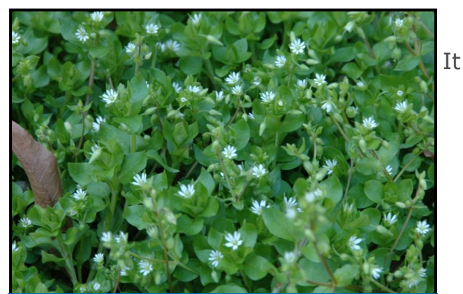
Common chickweed (Stellaria media)

is an invasive species. It is a winter annual, seeds germinate in late summer. Seedlings become dormant over the winter. It sets seeds in spring and early summer and dies. It can become perennial in cool and moist areas. Thousands of seeds are produce per plant. Stem rooting contributes to its dissemination.