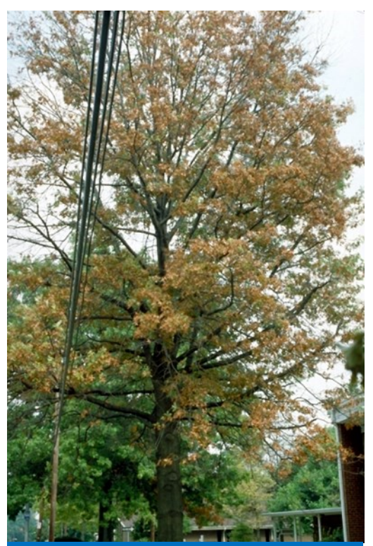
Figure 2. Pin oak tree that has turned entirely brown prematurely from many years of bacterial leaf scorch infection.

http://www2.ca.uky.edu/agcollege/plantpathology/ext_files/PPFShtml/PPFS-OR-W-12.pdf