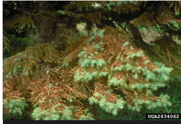
Figure 1 — Needles infected with Rhizosphaera turn purplish brown during summer <u>Photo: USDA</u> Forest Service Archive