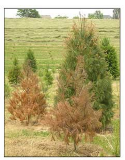
ROOT LOSS FROM PHYTOPHTHORA ROOT ROT CAN CAUSE DEATH OF ENTIRE PLANTS, ESPECIALLY IN YOUNG TREES.

Cankers caused by White Pine Root Decline begin at the tree base, progress upward, and usually "ooze" a sticky resin.