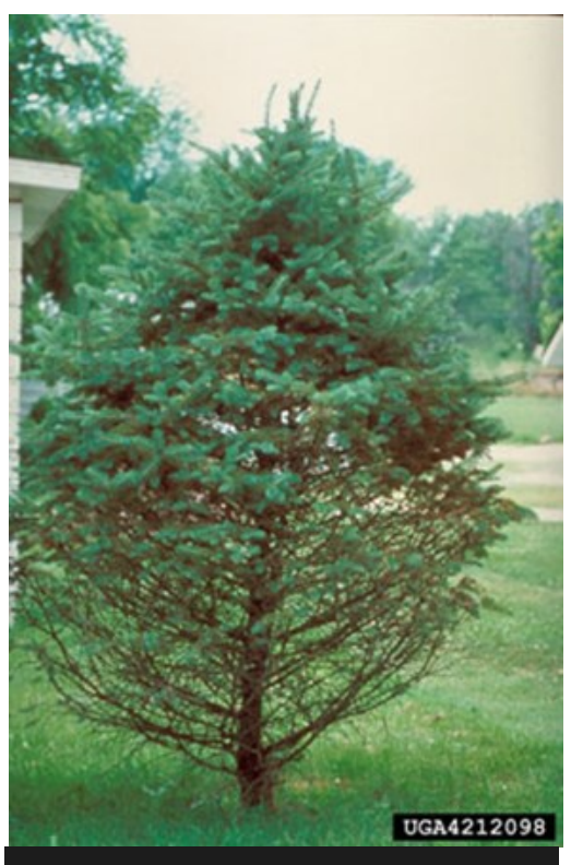
Figure 2 — Needle drop and thinning of lower canopy are classic symptoms of Rhizosphaera needle cast in spruce