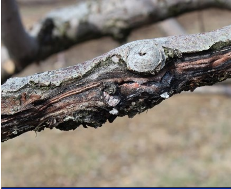
Figure 1) Cankers can provide an overwintering site for plant pathogens.