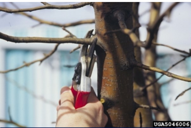
Figure 2) When removing cankers, make cuts well below visible symptoms or at the base of branches.