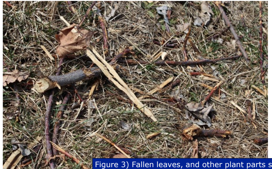
Figure 3) Fallen leaves, and other plant parts should be gathered and discarded.