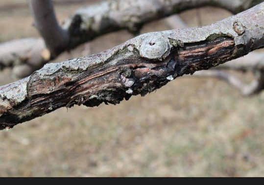
Figure 1 — Cankers can provide an oversintering site for plant pathogens.

Autumn has arrived in Kentucky and, as leaves change color and fall from trees, it is time to focus on landscape sanitation. Good sanitation practices can help reduce disease-causing pathogens. These organisms can survive for months or years on dead plant material or in soil, causing infections in subsequent years. Elimination of disease-causing organisms reduces the need for chemical controls and can improve the effectiveness of disease management practices. Following these sanitation practices both in autumn and throughout the growing season can reduce disease pressure in home and commercial landscapes.