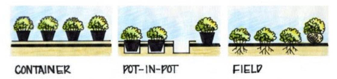
Figure 1. Three production systems: Plants are grown above-ground in containers on a container bed; plants are grown in containers placed in below-ground socket pots (pot-in-pot); or plants are grown directly in the field and harvested balled and burlapped or bare root.

While shoot hardiness of temperate plants is important when making overwintering decisions, roots rarely, if ever, will survive temperatures below -10F, therefore, root hardiness should be our primary concern related to making overwintering decisions. Young roots of some plants do not seem able to acclimate at all, mature roots normally are able to tolerate more cold than young roots.