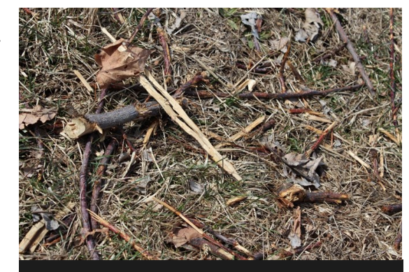
Figure 3 — Fallen leaves and other plant parts should be gathered and discarded \,