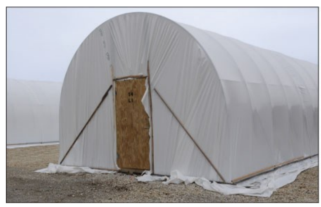
Figure 3. Poly-covered Quonset-type greenhouses are used for winter protection of container grown plants.

Attempts are made, where feasible, to orient the houses south to north. Plants in the southeast corner, may receive more light and day length, requiring more frequent observation. With plants that are particularly cold sensitive a poly blanket should be set in the house so that if abnormally cold temperatures are encountered (below 0F or less) it can be pulled over the plants to provide a second layer of cover.