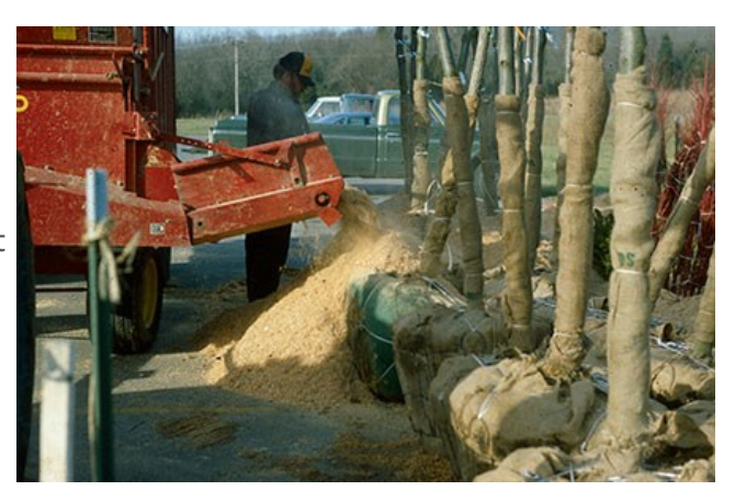
Figure 4. Mulching with sawdust in preparation to overwinter ball-and-burlapped trees.