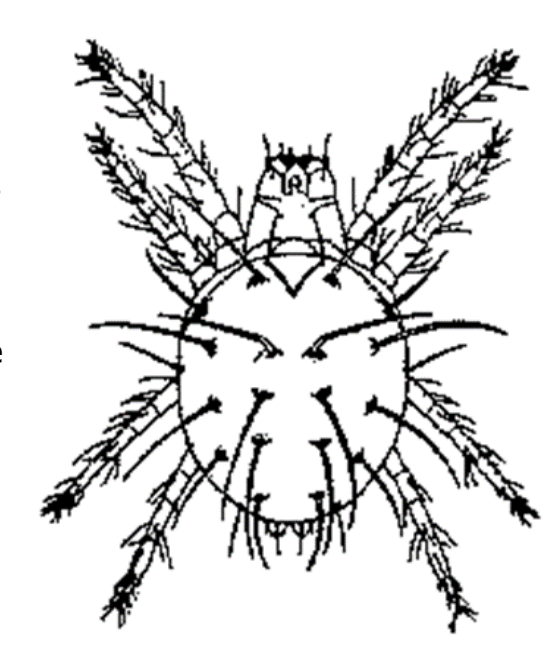
EUROPEAN RED MITE FEMALE

It is especially common on flowering fruit trees such as apple/crabapple, cherry, pear, plum, hawthorn, and serviceberry. European red mites overwinter as bright red eggs laid in clusters on branches, limbs and trunk, often in such great number that the bark seems to be covered with red brick dust. Following spring egg hatch, there may be several generations per year. Development from egg to adult varies from about 3 weeks at 55 degrees F to less than 1 week at 77 degrees F. All life stages (eggs, immatures, and adults) are brick red.