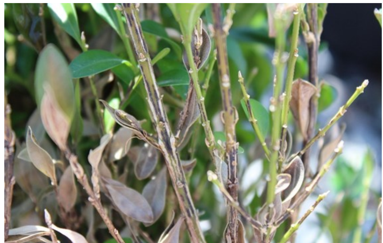
Figure 3. Symptoms of boxwood blight on stems may appear as dark brown or black streak-like lesions.