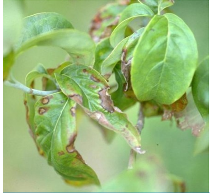
Figure 1. Dogwoods affected by anthracnose develop leaves with medium-to-large spots with purple borders or scorched tan blotches