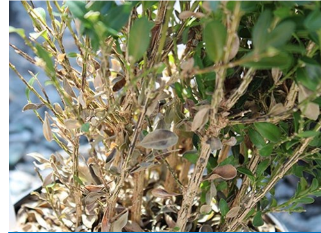
Figure 2. Defoliation of the lower portions of the plant is often the first noticeable symptom of boxwood blight