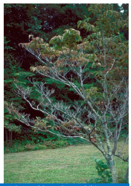
Figure 1. Infected petioles and branches exhibit dieback, typically beginning on lower branches