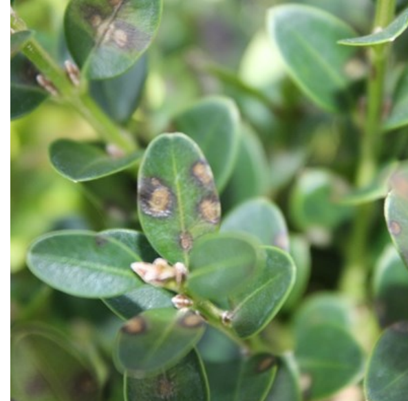
Figure 1. Early symptom of boxwood blight include the development of circular leaf spots with dark borders