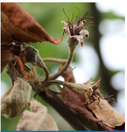
Figure 1. Apple flower clusters infected with fire blight.