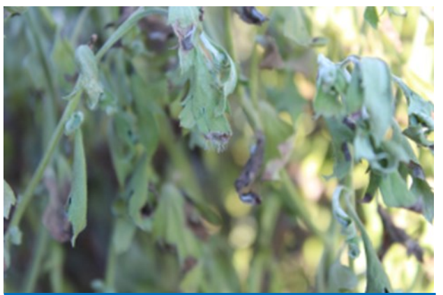
Figure 4. Fungal "webbing" of Rhizoctonia web blight may be visible on upper plant parts.