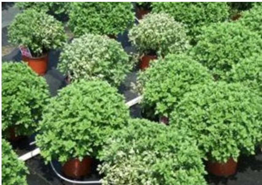
Figure 6. Fusarium wilt causes yellowing and wilting as fungi affect vascular tissue and water transport.

This fungal pathogen invades vascular systems and causes leaf yellowing and plant wilt (Figure 6). Fusarium fungi infect plant roots and then colonize internal tissue. Collapse of these "water and nutrient highways" can result in starvation of upper plant parts. Often, a single branch or plantlet will show symptoms before the rest of the plant. Necrosis or brown streaks may be visible on outer surfaces of stems, and cross sections usually indicate necrotic (brown decaying) vascular tissue. Often, Fusarium wilt present with one or more other soil-borne