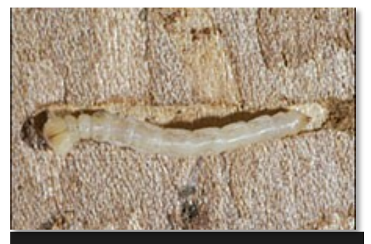
Larva of the Bronze Birch Borer.