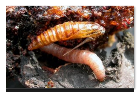
Larvae and pupal case of lesser peach tree borer under bark of infested wound

Control: Control of lesser peach tree borers in commercial orchards relies on preventing larval establishment underneath the bark. Once under the bark, chemical control is usually ineffective. Insecticides should be timed just before or to coincide with egg hatch.