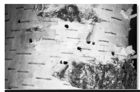
D-shaped holes left by the adult bronze birch borer beetles as they emerge from limbs or trunks.

ENTFACT-43 Insect Borers of Trees and Shrubs