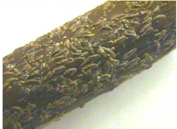
Overwintering scale insects

Dormant oil applications must be made when temperatures stay above freezing for 24 hours. As always, be sure to follow all label directions because certain oil sprays may damage certain plants. For example, the needles of Colorado blue spruce can be discolored by dormant oil applications.